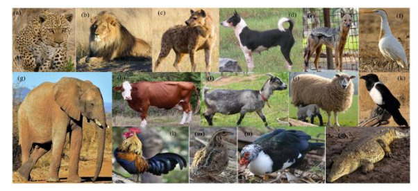
Figure 4. Examples of species cited in Fuliiru proverbs. (a) Ngwi (Panthera pardus), (b) ndare (Panthera leo), (C) ikihumbu (Crocuta crocuta), (d) akabwa (Canis familiaris), (e) nyambwe (Lupulella adusta), (f) nyange (Bubulcus ibis), (g) njovu (Loxodonta Africana), (h) Ingaavu (Bos taurus), (i) Imbene (Capra hircus), (j) kibuzi (Ovis aries), (k) Jongo (Corvus albus), (l) Ingoko (Gallus domesticus), (m) ingwale (Coturnix coturnix) (n) Ibaata (Cairina moschata), (o) Ingoona (Crocodylus niloticus).